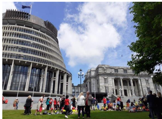
International Children’s Day 2019 children’s picnic at Parliament

To further mark the occasion of the 30 th anniversary of the UN Convention on the Rights of the Child, the Children’s Rights Alliance, the Office of the Children’s Commissioner, Save the Children and UNICEF supported the publication of a pocket version of the UN Convention on the Rights of the Child in both English and Te Reo Māori, so that the Convention can be widely promoted, understood and used in New Zealand.