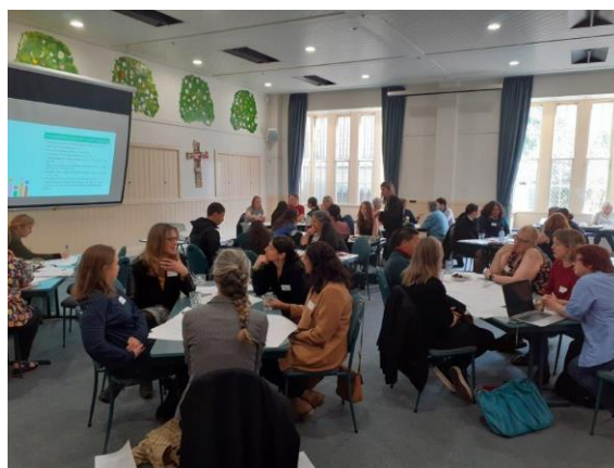
Workshops hosted by Children's Rights Alliance Aotearoa on civil society reporting to the UN Committee on the Rights of the Child